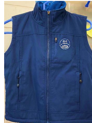
Winter Double Side Vest