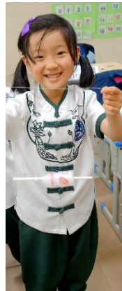
Summer Uniform (2-piece suit)