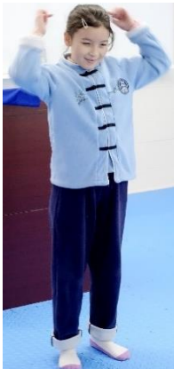
Winter Uniform (2-piece suit)