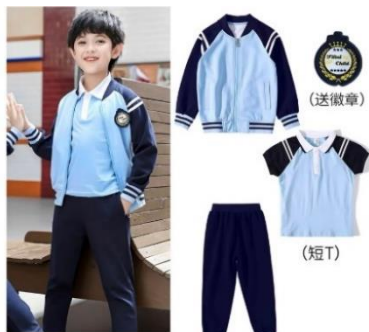
Sports Uniform (3-piece suit)